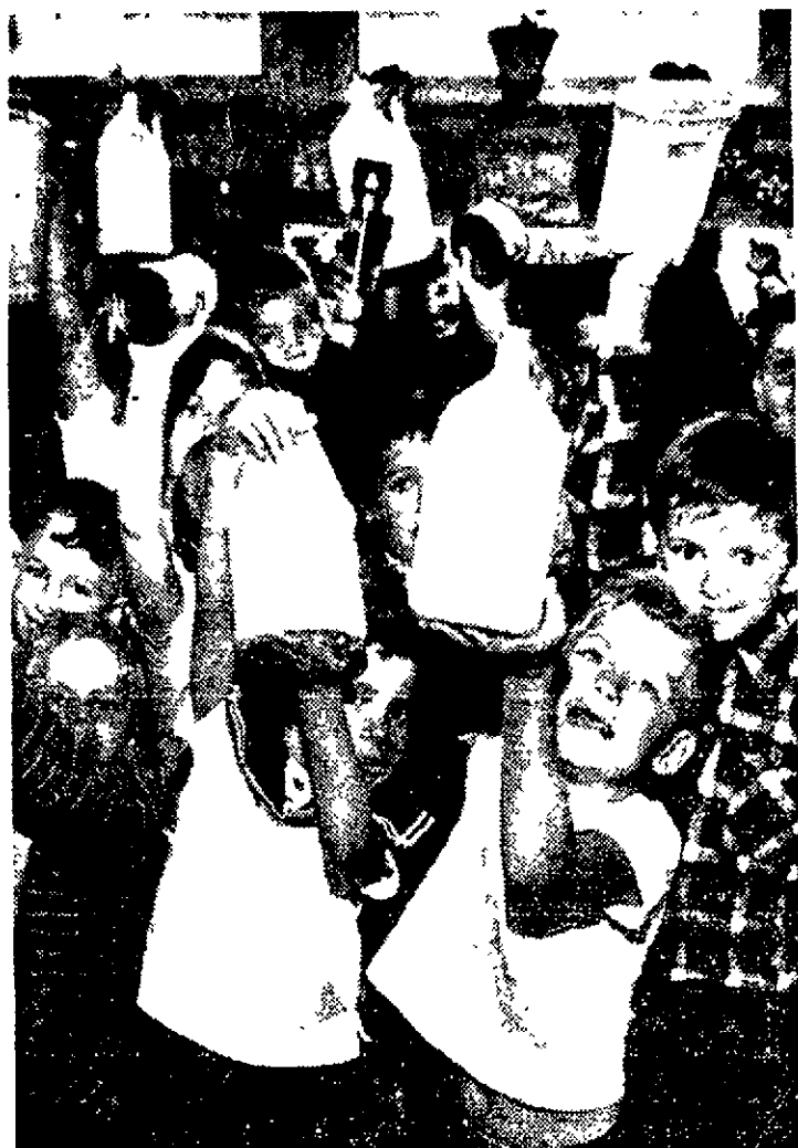
EMERGENCY RATIONS—First graders at Tampa, Fla., elementary school hold up canned food and jugs of water they brought to school as part of Civil Defense preparation during Cuban crisis.