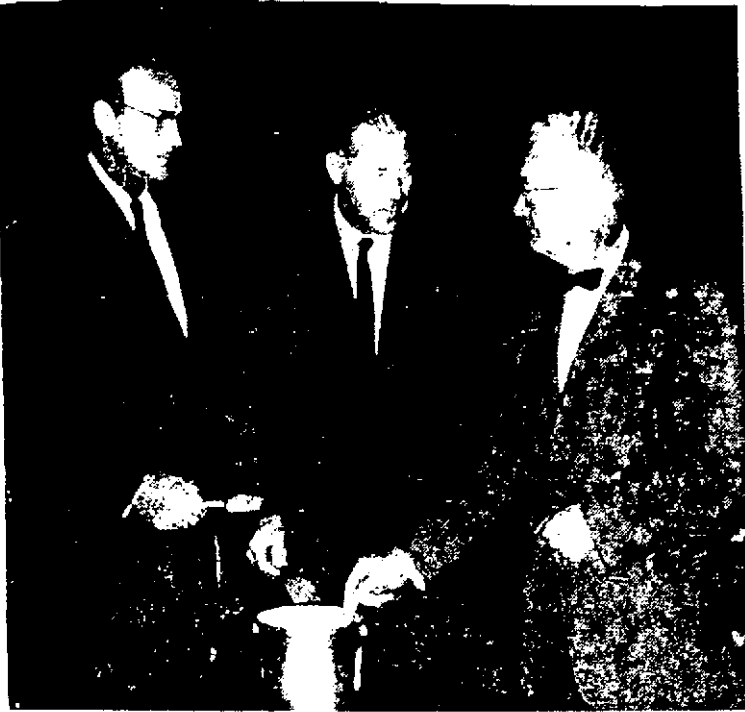
A UNIQUE GROUND-BREAKING ceremony for the Mountain States regional office of State Farm Insurance Companies was held Tuesday noon at the Greeley Country Club. Instead of going to the site of the building, south of Greeley, the ceremony was held at tables at the luncheon. On each table was a bucket with