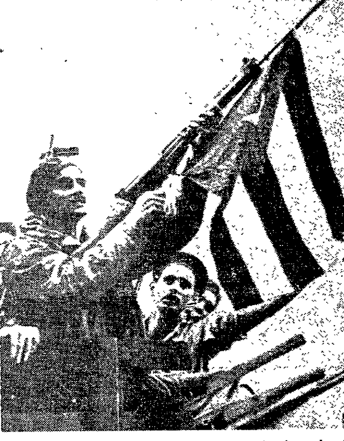
A Cuban militiaman on his way to his post for the alert raises the Cuban flag on his rifle, according to caption for this picture transmitted today over the Cuban government network.

STOCKHOLM, Sweden (AP)—John Steinbeck won the 1962 Nobel Prize for literature today. The 60-year-old California-born author, who rose to fame with his novel "The Grapes of Wrath," is the sixth American to win the literary award—this year worth $48,656. For 30 years, Steinbeck has been turning out best sellers—many became prize-winning stage plays and films—and gained a reputation as a chronicler of social justice in the United States. His writings in recent years showed a versatility that emerged in his latest book, "Travels with Charley," an off-whimsical story of U.S. travels with his dog Charley. WROTE 27 BOOKS Steinbeck, author of 27 books, was cited by the prize committee "for his at one and the same time realistic and imaginative writings, distinguished as they are by a sympathetic humor and a social perception." Steinbeck heard about the award at his home in Sag Harbor, N.Y. His wife told reporters it was "a great thrill" for him. Other American winners of the Nobel Prize for literature were Sinclair Lewis, Eugene O'Neill, Pearl Buck, William Faulkner and Ernest Hemingway. Thomas Stearns Eliot, American-born, also won the award, but after becoming a British subject.