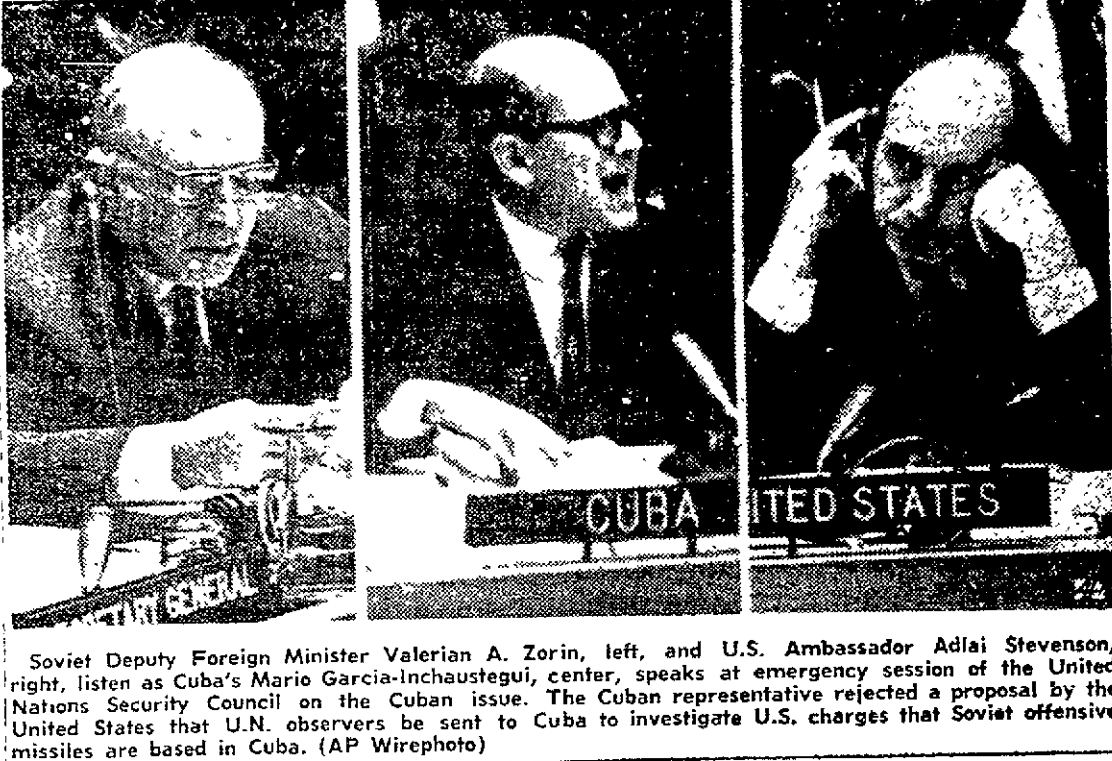
Soviet Deputy Foreign Minister Valerian A. Zorin, left, and U.S. Ambassador Adlai Stevenson, right, listen as Cuba's Mario Garcia-Inchausti, center, speaks at emergency session of the United Nations Security Council on the Cuban issue. The Cuban representative rejected a proposal by the United States that U.N. observers be sent to Cuba to investigate U.S. charges that Soviet offensive missiles are based in Cuba.