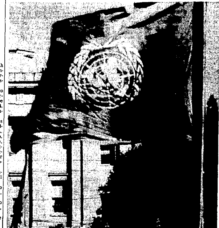
SIGN OF THE TIMES

Perhaps a sign of the times, perhaps just a mixed up flag hanger. The UN flag, which is the world encircled with a wreathe, is shown in