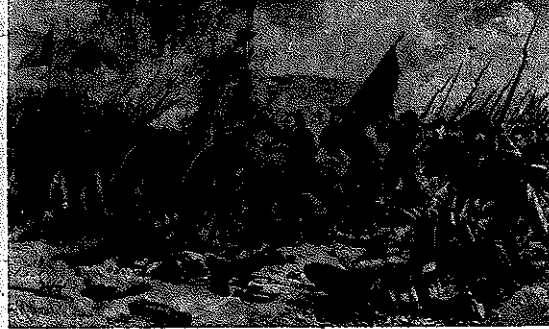
PICKETT'S CHARGE: Officer in center with an saber is Brigadier General Armistead, mortally wounded in this desperate climax of Gettysburg.

By DR. DOUGLAS S. FREEMAN General Lee's army of Northern Virginia, Chambersburg, Pa., near Gettysburg, Pa., July 3, 1863.