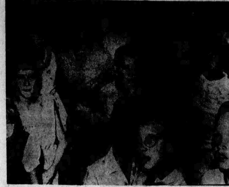
Negro mother leads son, 6, through white pupils in Dallas.