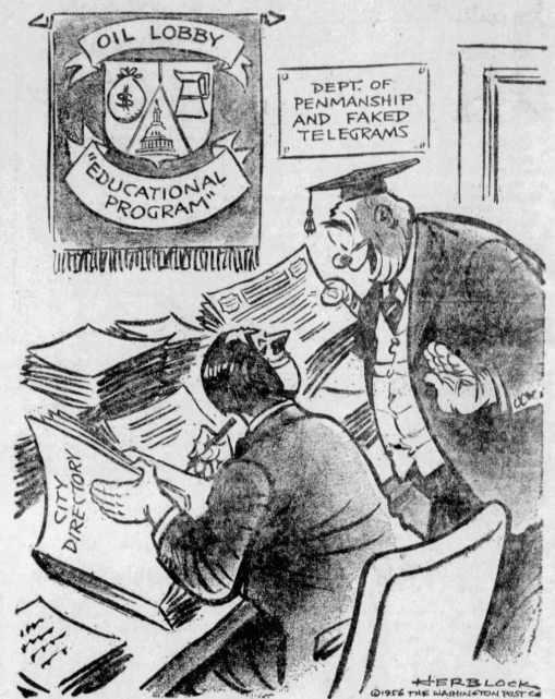
HERB LOCK 1956 THE WASHINGTON POST