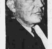
HAROLD STASSEN Gallup Re-Chicken