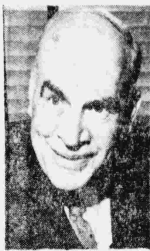
GOV. HODGES Talking Up Adlai

ATLANTIC CITY, N. J. COMFORTABLE couch in the lobby of the Shelburne Hotel, strategically placed between the front door and the Diamond Jim Brady Room where the 48 state governors are meeting the press, was staked out today by the Hon. William M. Hodges of Chicago.