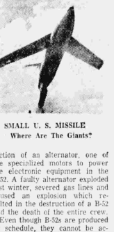
SMALL U. S. MISSILE

the Strategic Air Command. Until long and intermediate range missiles are developed, the SAC, equipped to deliver atom and hydrogen bombs, is considered the chief deterrent to war.