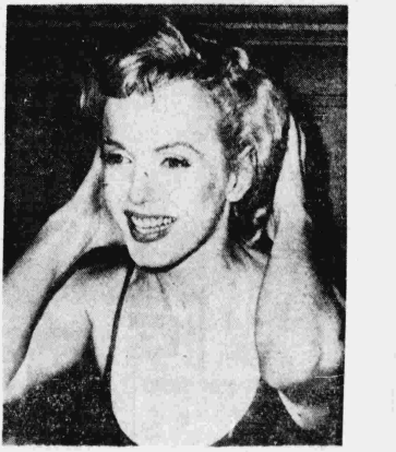
ACTRESS MARILYN MONROE is pictured in New York as she revealed plans to marry playwright Arthur Miller. They said they'll wed "before July 13" in either New York or Roxbury, Conn., but kept exact date secret.

Only one case, a 23-year-old Park Creek man, has been reported in the county this year. His illness was diagnosed as a fairly light attack of polio last week.