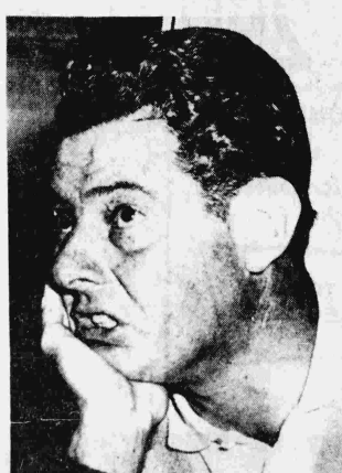
CARY MIDDLECOFF... world's greatest