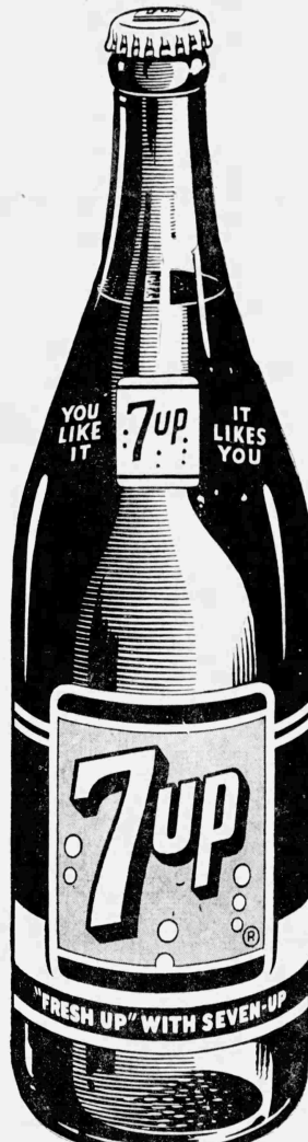
20c Per Bottle