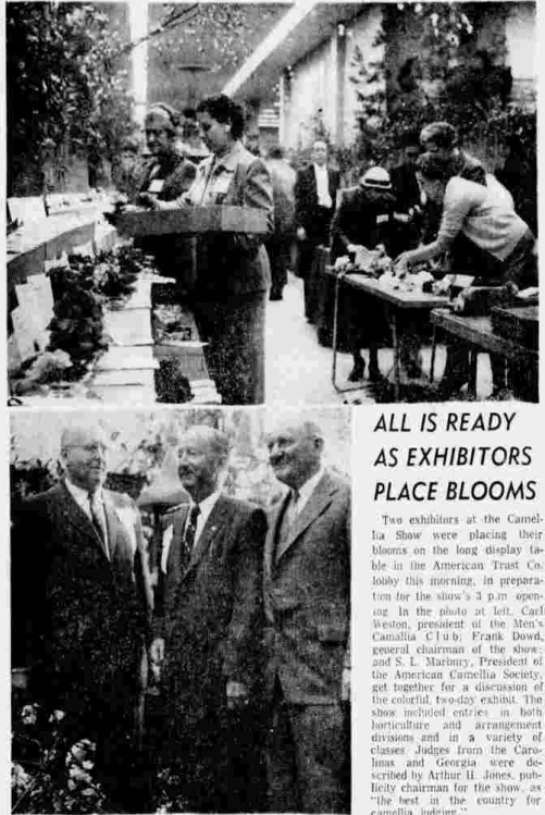
ALL IS READY AS EXHIBITORS PLACE BLOOMS

Two exhibitors at the Camellia Show were placing their blooms on the long display table in the American Trust Co. lobby this morning.