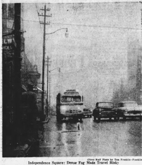
Independence Square: Dense Fog Made Travel Risky