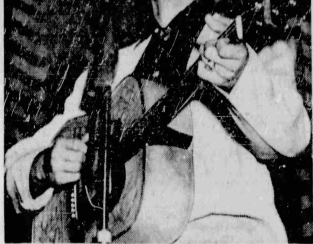
ELVIS PRESLEY... Shakes, rattles; audience rolls