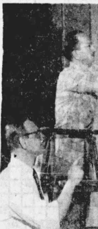
ARTISTS HANDLING the exhibit.

The public entering American Trust Co. will walk into one of the Guild of Charlotte Artists' annual exhibits Monday morning. The exhibit spent today setting up the exhibit of about 60 paintings by local artists. Included are pastels, watercolor and oils.