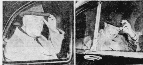
Bulganin and Eisenhower: More Than An Exchange Of Pleasantries