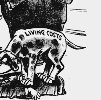
HERBLOCK 8919E THE WASHINGTON POST

THE new administration trend toward lining up with the Afro-Asian axis and letting Western allies, if necessary, drop out of the cause.