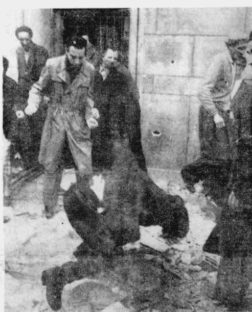
BODY OF HUNGARIAN secret police-man appears to be caught in slow motion as it crumples face down toward debris in front of his Budapest headquarters.

SOUTHPORT — A Laurinburg fisherman who had been missing for 12 days in an open boat and presumed dead was rescued in the Atlantic Ocean yesterday and landed here this morning in "surprisingly good" condition.