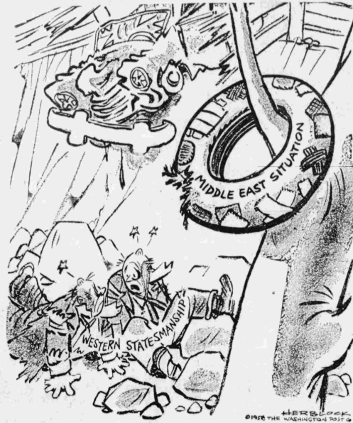
Nasser Found With Busted Flush