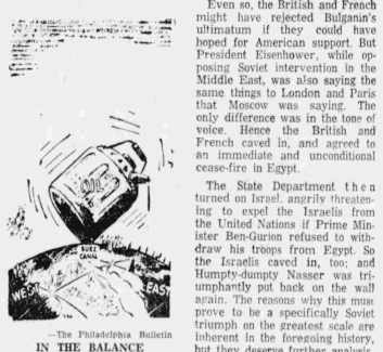
The Philadelphia Bulletin IN THE BALANCE