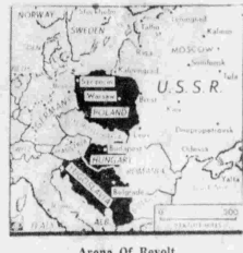
Area Of Revolt

THE next act in the great drama being played out in Central Europe will be the appearance of Messrs. Khrushchev & Bulganin on the tightrope.