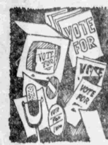
In Sound And Fury...