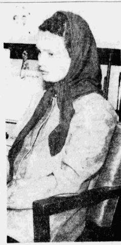
Caril Fugate (Left) Talks To Police And Starkweather Eats In Jail Cell

The major military achievement of the conference was expansion of the previous military planning committee into a full military planning staff. Conference sources said it would be bigger and more effective than the previously loosely organized committee.