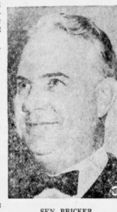
SEN. BRICKER Another Try

WASHINGTON (AP)—I never tell the truth, Mr. Truman has so vocal on this point of late, but my wife still seems to agree with his original point of view and the other day it's possible that she caught me in an untruth by reason of silence.