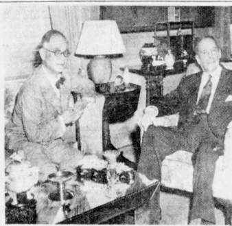
showed the USS Missouri on Sept. 2, 1945. At right, 10 years later, the two met for a friendly chat in MacArthur's New York hotel suite.