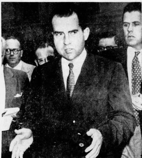
Vice President Nixon Tells Reporters Of Cabinet Meeting.

WASHINGTON —The Eisenhower team worked today on plans for keeping the government running smoothly while the President recuperates from a heart attack. A National Security Council meeting was scheduled for Thursday day, both under the gavel of Vice President Nixon.