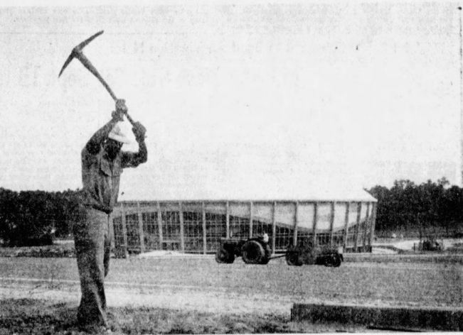
Workman Raises His Pick As The Parking Lot Takes Shape