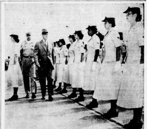
He Reviews WAFs At West Point.

By NORMAN WALKER DETROIT (AP)—The CIO United Auto Workers Union today was reported to have agreed to extend its General Motors contract from midnight tonight to midnight Sunday.