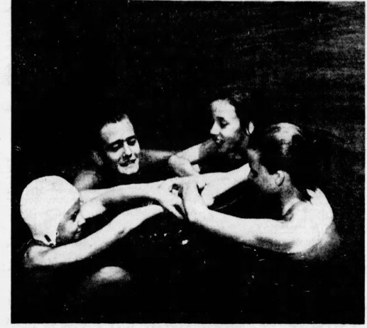
Rem And All, It Floats! The Latest Water-Borne Life-Saver.