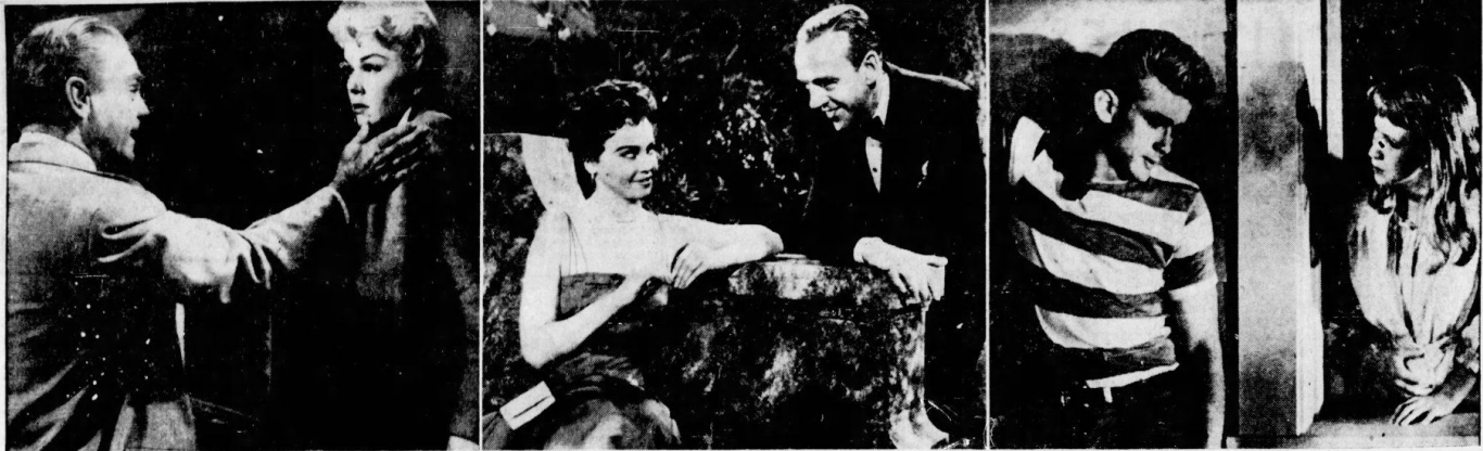
If you like movies you'll love "LOVE ME OR LEAVE ME," now being held-over at the Imperial. Starring Doris Day, James Cagney and Cameron Mitchell, it is a picture that will demand Academy Award attention.