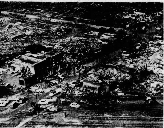
Aerial View Shows All That's Left Of Tornado-Wrecked Town Of Udall, Kan.