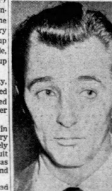
ROBERT MITCHUM ... I'm well done

The heads of government Please Turn to Page Two See "West Asks"