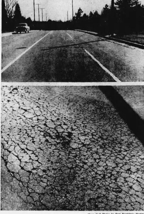
THIS MODERN TRAFFIC can be pretty rough on modern street surfacing, and evidence includes these two pictures of Selwyn Ave. This portion of Selwyn, a few blocks from Park Rd., was paved in August, 1954—seven months ago—and already the surface has given way. Why? City engineering officials say the eight-inch stone base may have had moisture which froze during the winter, causing the pavement to crack. Or, they say, low places that were filled in before the surfacing was done may have settled.