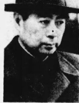
RED CHINA'S CHOU EN-LAI LISTENED QUIETLY TO CRITICISM THAT HE HAD TO FIND A NEW WAY TO REVIVE COLONIALISM.

BANDUNG, Indonesia — (AP) — Iran's Foreign Minister Fadhl Jamal denounced international Communism before the Asian-African conference today and drew prolonged applause from many of the 29 delegations.