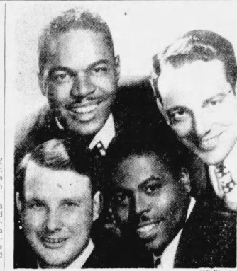
The Mariners . . .

WASHINGTON (AP) — Secretary of State Dulles is expected to reject again the request of an American couple to visit their airman son in his Red China prison.