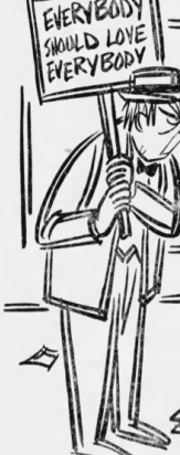
EVERYBODY SHOULD LOVE EVERYBODY