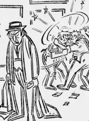
LIKE MEDICINE The Choice Is His