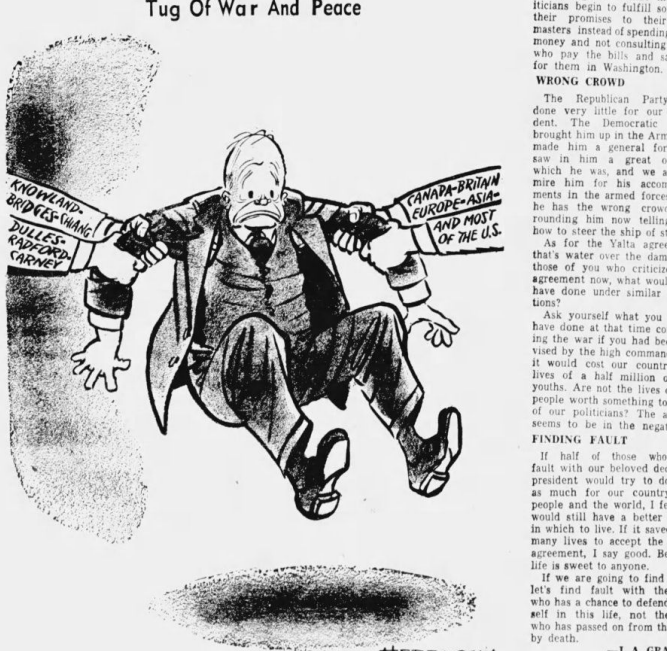
HERBLOCK (SPEECH BY THE WASHINGTON POST)

THE Republican Party has done very little for our president. The Democratic Party brought him up in the Army and made him a general for they saw in him a great officer, which he was, and we all admire him for his accomplishments in the armed forces. But he has the wrong crowd surrounding him now telling him how to steer the ship of state.