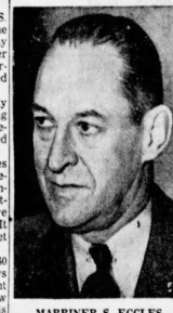
MARRINER S. ECCLES

WASHINGTON (AP)—President Eisenhower told America's European allies today the United States will maintain its "fair share" of military forces in Europe so long as there is a threat to the area.