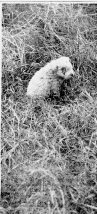
AND THE RAINS CAME and he shivered. He was injured, apparently struck by a car, and he limped to a fuel oil Baxter St. near Independence Blvd. News photographer Jeep Hunter was on a routine assignment this morning when he spotted the dog in the rain.

WASHINGTON (AP)—A House committee probing governmental information policies announced today plans for further hearings on a reported attitude in some agencies that the public "has little or no right to know" what is going on.