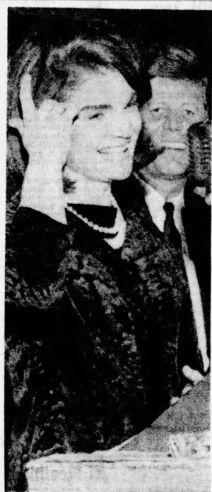
JACKIE BRUSHES BACK HAIR DURING BANQUET nearby: her husband the president

DALLAS (UPI) — President Kennedy may dump Vice President Lyndon B. Johnson as his 1964 running mate if the going gets rough, former Vice President Richard M. Nixon predicted Thursday.