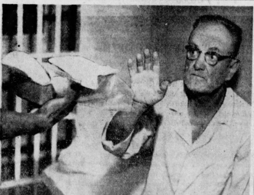
away. He's on a hunger strike in protest of a court order, saying he must pay his wife alimony.