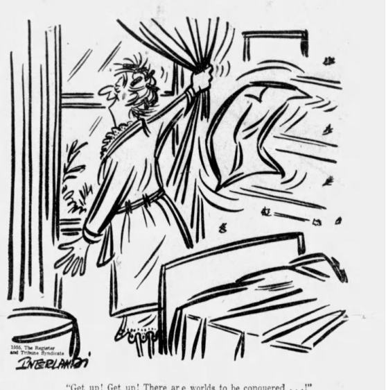
"Get up! Get up! There are worlds to be conquered...!"

When President Eisenhower was struck down, for instance, the iron news curtain really clamped down over everything per-