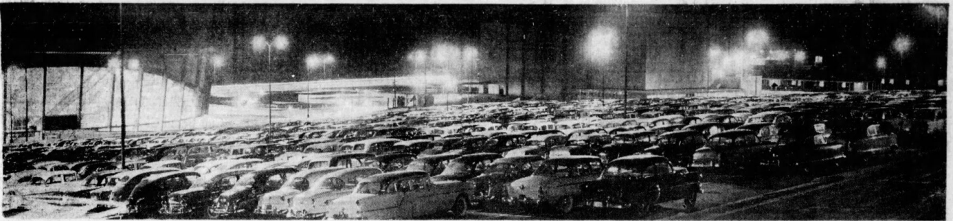
After Parking Headaches At A Couple Of Early Concerts, Officials Ironed Out Kinks, Parked Cars Without A Hitch At Ice Capades.