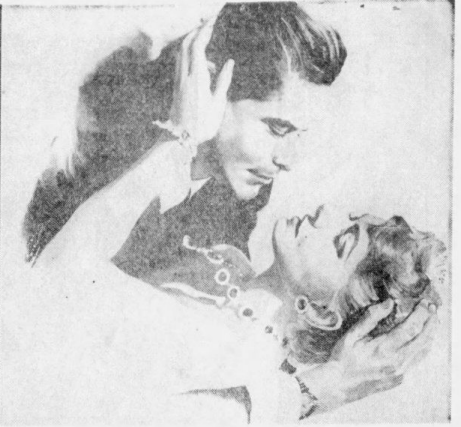
"Interrupted Melody" returns to the Dilworth Theater Wednesday. Eleanor Parker and Glenn Ford bring this life-inspired story to the CinemaScope screen.

A SMALL BIGAMY? HOUSTON, Tex. — A man called the cops and wanted to know why his friend was jailed. The jailer said there was a suspicion the fellow had a wife in Mexico as well as Houston. "Oh," said the caller. "I was afraid it was something serious."