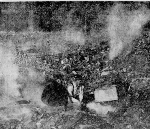
FIREMEN FROM ENGINE CO. 4, W. 8th St. Station, were on duty today at the W. Trenton Ave. "Blue" fire which burst into the spotlight with underground burning yesterday.