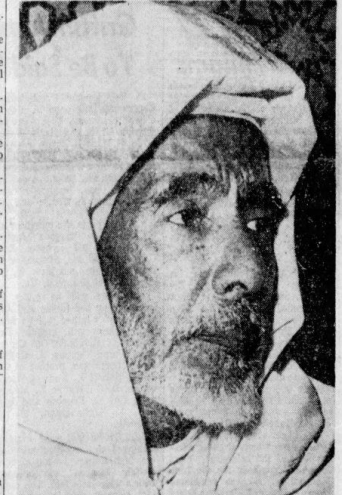
SULTAN MOHAMMED BEN MOULAY . . . He quit.