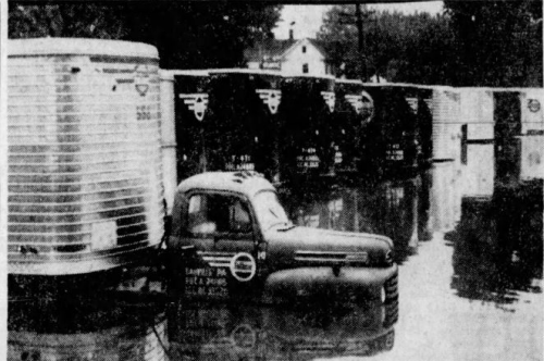
Flash Flood Hits Truck Parking Lot In Danville, Pa.

The bus, which had a seating capacity of 47, had left Chicago about 11 a.m. for Michigan City, 53 miles southeast of Chicago.