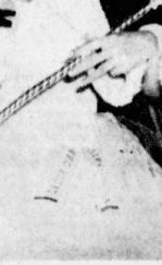
Third-Place Miss South Carolina Parades . . . So Does Miss California, Who Becomes the Queen . . . And Miss America Cries With Joy

ATLANTIC CITY, N. J. (A)—A long-stemmed beauty from California, in the crown and robes of a queen, embarked today on a year-long whirlwind tour as the 1955 Miss America.