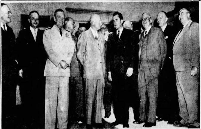
PRESIDENT EISENHOWER MEETS WITH SECURITY COUNCIL IN DENVER From left, Allen Dulles, Arthur Fleming, Adm. Radford, Lewis L. Strauss, Nixon, Secretary Wilson, John Foster Dulles, Treasury Secretary Humphrey, J. Edgar Hoover, Eisenhower, Harold E. Stassen and Rowland Hughes.

By THE ASSOCIATED PRESS The biggest primary election day of the year comes up tomorrow with nine states picking nominees for five Senate seats, six governor and 92 House seats.