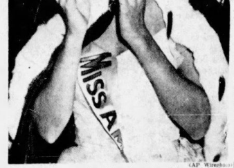
Third-Place Miss South Carolina Parades . . . So Does Miss California, Who Becomes the Queen . . . And Miss America Cries With Joy

ATLANTIC CITY, N. J. (A)—A long-stemmed beauty from California, in the crown and robes of a queen, embarked today on a year-long whirlwind tour as the 1955 Miss America.