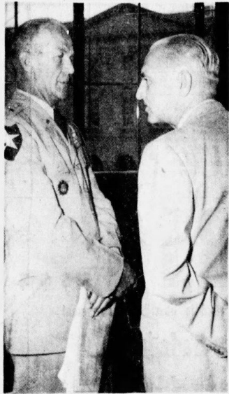
GEN. RALPH ZWICKER GEN. KIRKE LAWTON They Figure In The McCarthy Hearing.