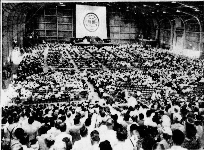
View Of Northwestern University's Memorial Hall As World Council of Churches Met.

WASHINGTON (AP)—Congressional leaders agreed at a White House conference today to try to push through Congress a new bill to outlaw the Communist party as such. In a session with President Eisenhower, the decision was to get the House to pass a measure declaring the Communist party is unlawful and without any rights. It would not make membership in the party by individuals unlawful. But Speaker Martin (R-Miss.) and Sen. Ferguson (R-Mich.) said the government already can go after individual Communists, and is doing so under the Smith Act, which makes it illegal to conspire to overthrow the government. The new approach is intended to supplant a bill that whipped through the Senate last week which would make it a crime to belong to the Communist party provided a person committed an overt act while a party member.