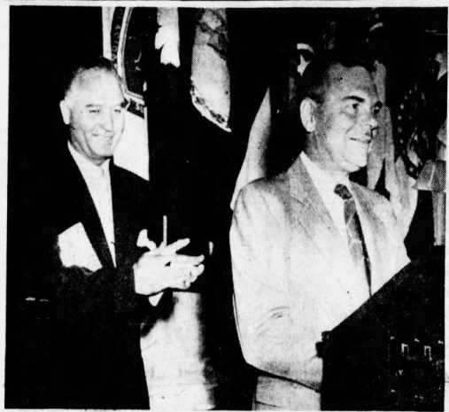
GOV. DAN THORNTON GOV. THOMAS E. DEWEY Leaders in 46th Governors Conference.