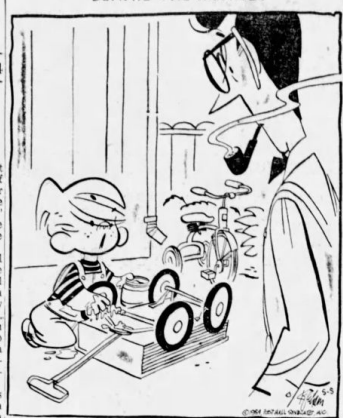
"What's the matter? I always grease my wheels with peanut butter!"